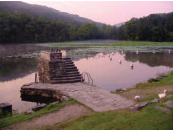
Lake Leatherwood Diving Platform

Welcome to Lake Leatherwood. This historic 1600-acre city park is a pristine example of Ozark Mountain countryside. Hardwood forests cover steep hills divided by a narrow 85-acre lake that is continuously recharged by cold spring water.